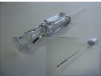
21G x 7cm Needle Accessory - Order #00010700