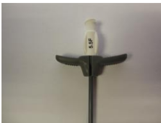
5.5F Introducer Sheath - Order #01055700